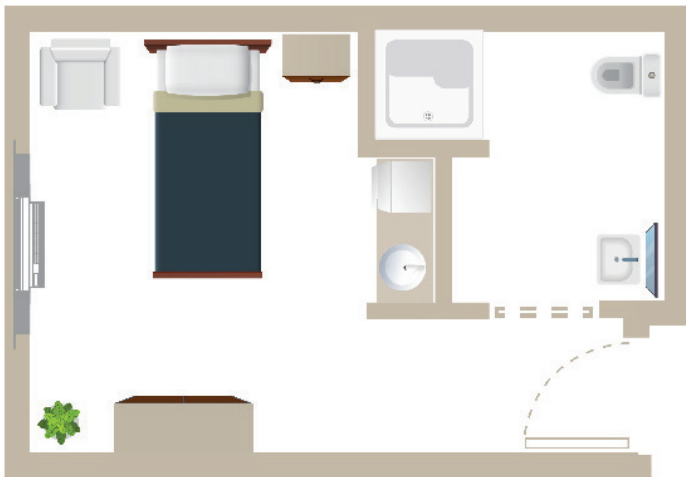
Private Suite #1

We provide a secure and comfortable lifestyle for senior living at The Drake. Our community includes an on-site beauty salon and barber shop, along with a wonderful private spa. All rooms have individual climate control and cable television. Our comprehensive activities and programming promise an engaging and fulfilling lifestyle.