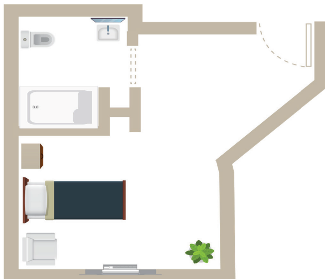
Private Suite #3