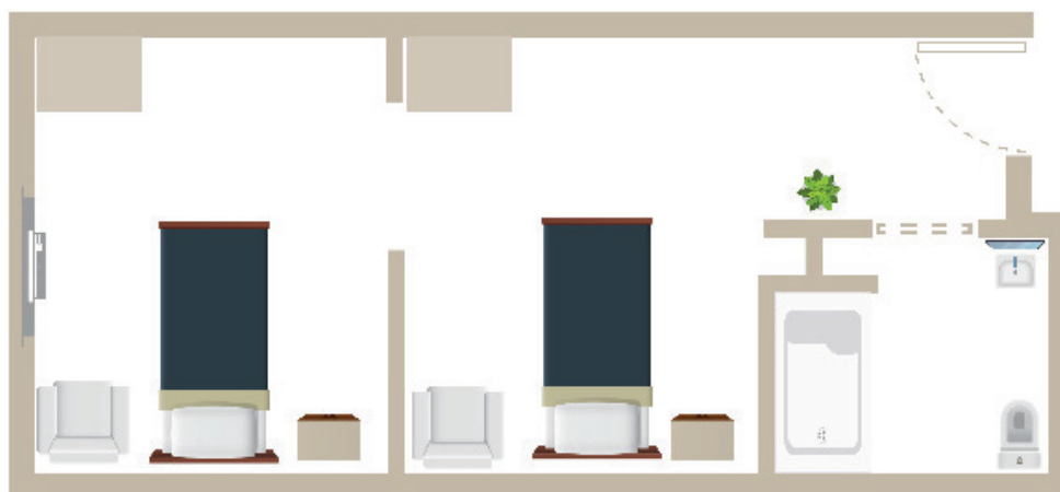
2 Bedroom - Shared Bath #2